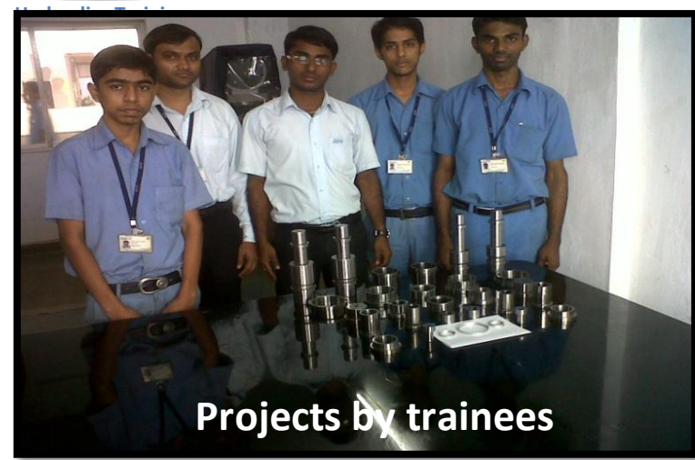
Projects by trainees