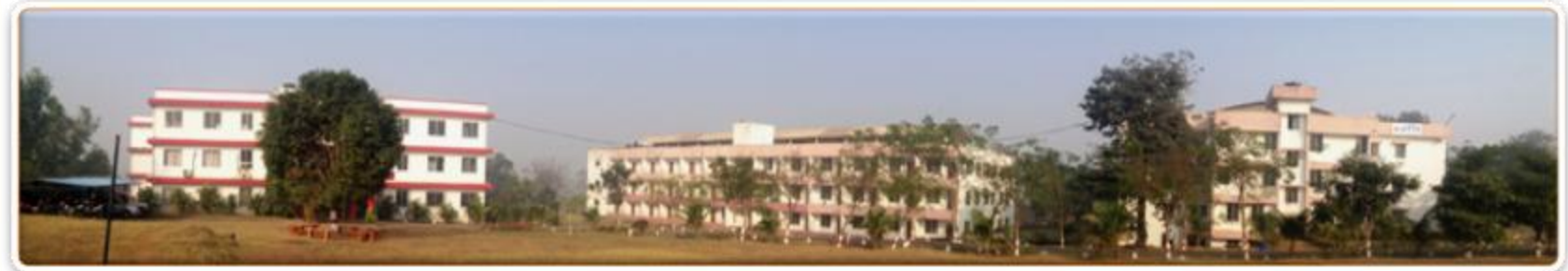
NTTF Murbad Campus